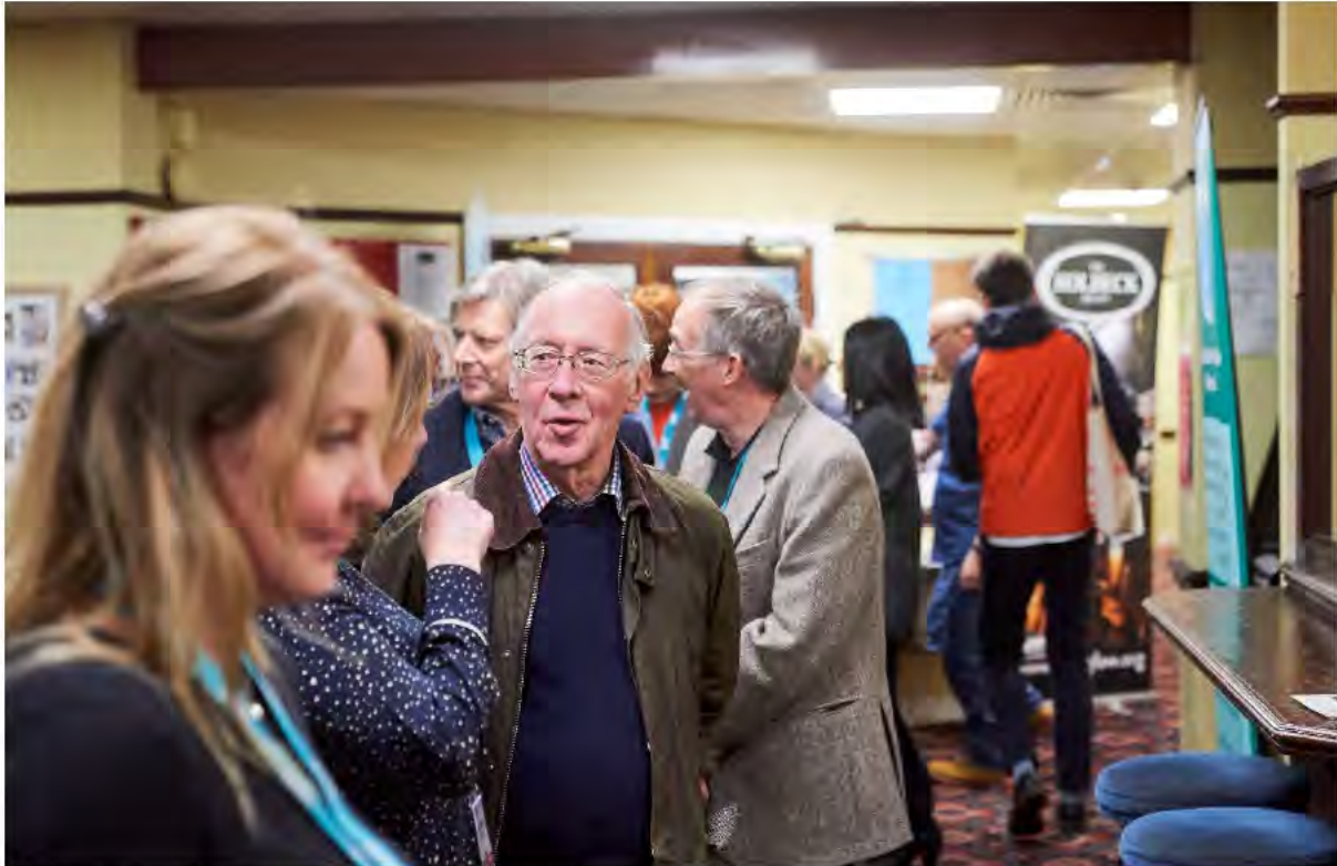
Delegates are welcomed into The Holbeck