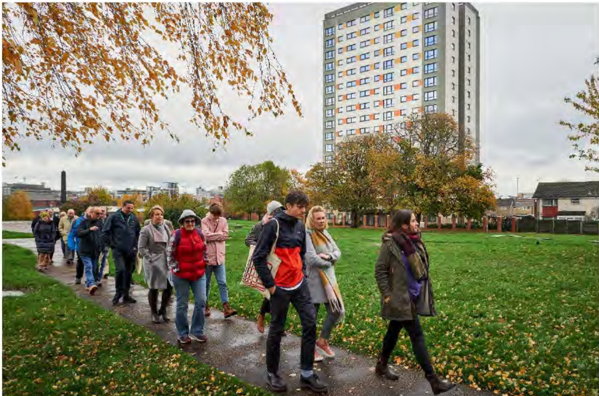
Delegates walk towards The Holbeck Working Mens Club