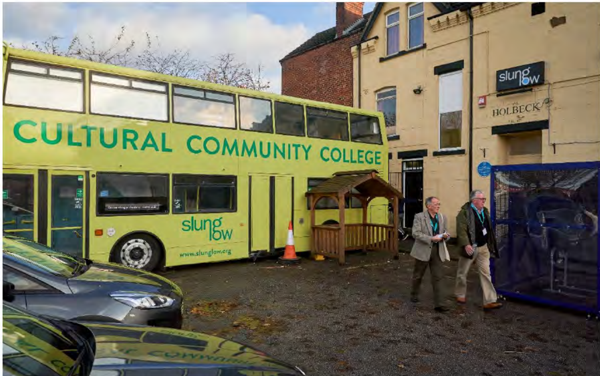
Delegates leave The Holbeck for a short bus ride back to Leeds City Centre